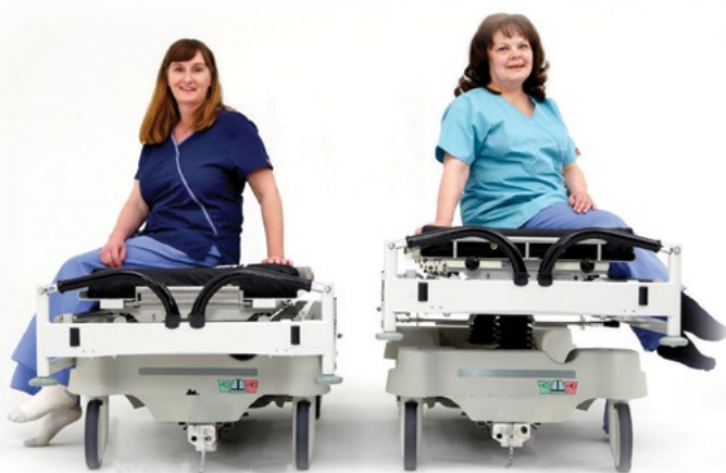
Low Profile Gurney (on left) compared to Standard Gurney (on right)