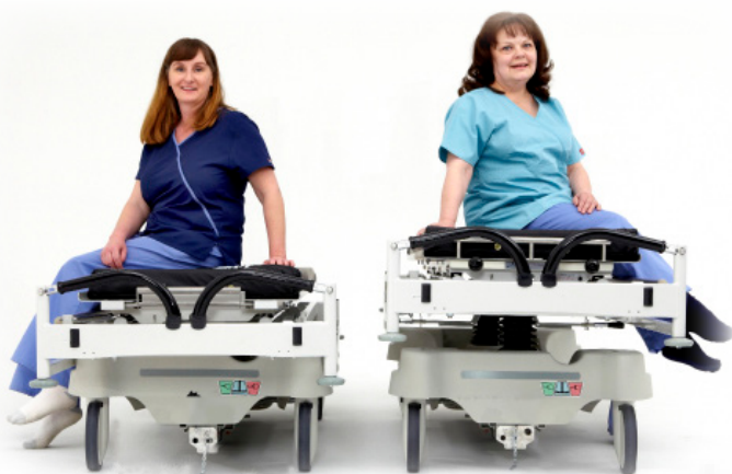
Low Profile Gurney (on left) compared to Standard Gurney (on right)