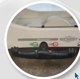
Hydraulic Foot Pedal