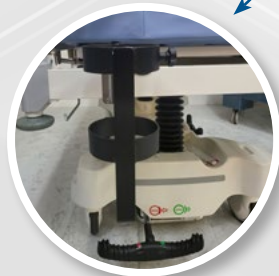
Fitted Oxygen Tank Holder