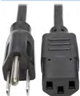
**Shown: Power Cord Receptacle (Part number 22223)